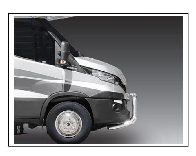
Figure 4 – Side view shown