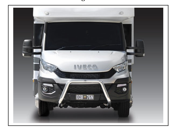
Figure 5 – Front view shown